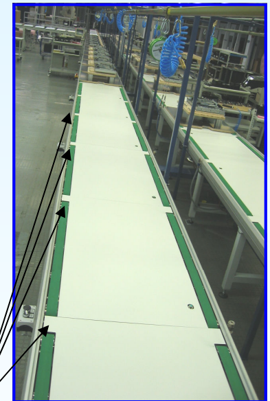
No stoppers required with MYM