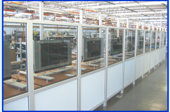
Overview of the Metz assembly line

And the cutting edge technologies employed in this system will also enable the production of new models in the future.